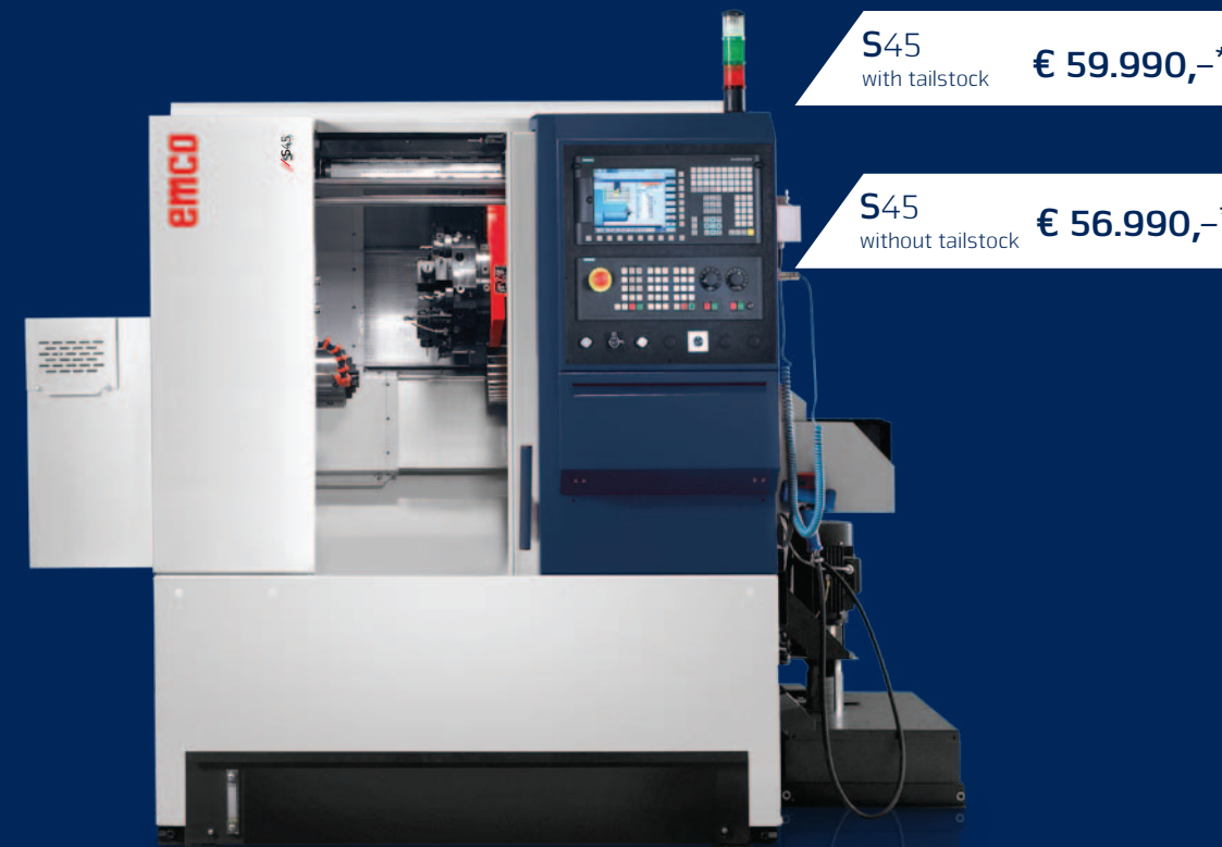
Machine with optional equipment

The compact CNC lathe with turn-mill turret is predestined for processing bar parts with a diameter of up to 45 mm and chuck parts of up to 220 mm. The main spindle features speeds of up to 6300 rpm and a main drive power of 11 kW. For shaft machining the machine is also available with an automatic tailstock. With an optimal accessibility the machine offers best conditions for the production of small lot sizes.