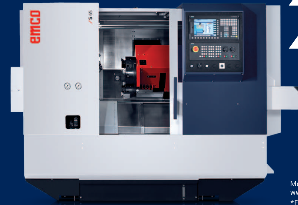
Machine with optional equipment

The compact CNC lathe with turn-mill turret is predestined for processing bar parts with a diameter of up to 65 mm and chuck parts of up to 310 mm. The main spindle features speeds of up to 4200 rpm and a main drive power of 18 kW. For shaft machining the machine is also available with an automatic tailstock. With an optimal accessibility the machine offers best conditions for the production of small lot sizes.